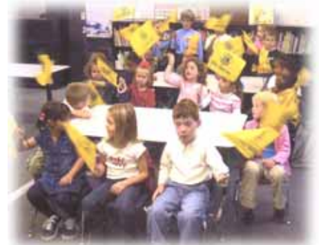
Diamondhead kindergarten children in their new library.