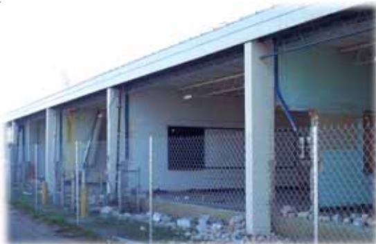
Diamondhead Elementary School after Katrina.