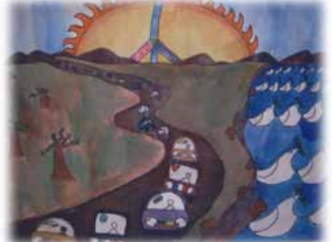
3rd Place Poster by Lindsay Power