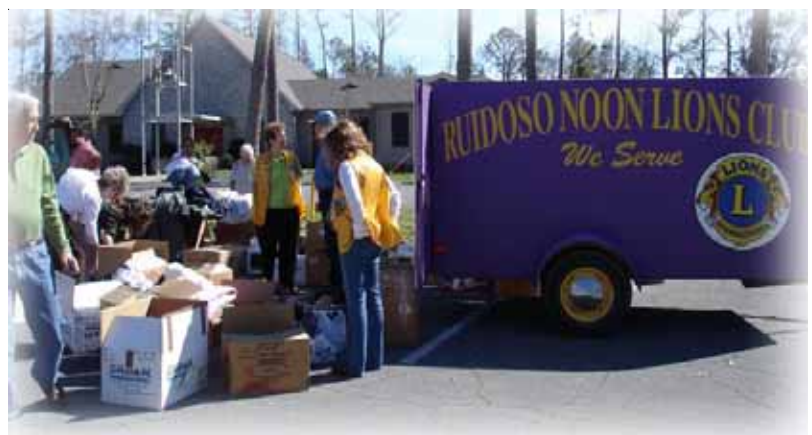
Diamondhead residents selecting needed items.