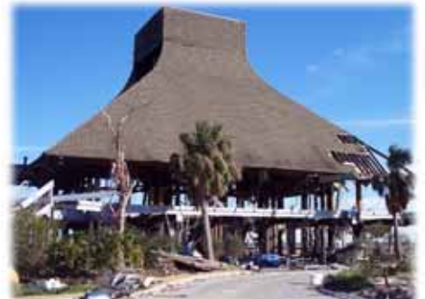
Diamondhead Marina and Yacht House after the storm.