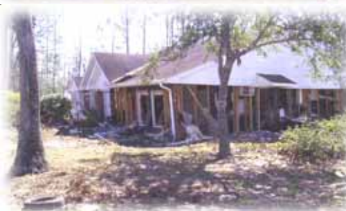
Diamondhead homes after Katrina.