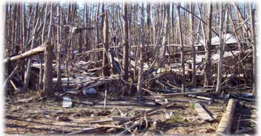
Typical destruction several blocks from the Diamondhead shoreline.